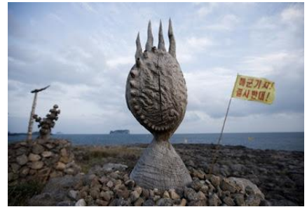
Sacred Gureombi rock on Jeju Island before the Navy base destruction began.